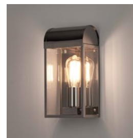
CODE: 1339002 FINISH: POLISHED NICKEL