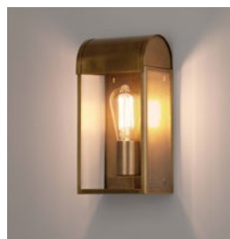
CODE: 1339003 FINISH: ANTIQUE BRASS

TO MAINTAIN THIS PRODUCT TO ITS BEST CONDITION, PLEASE VIEW OUR CARE AND CLEANING GUIDE ON THE SUPPORT SECTION OF THE ASTRO WEBSITE.