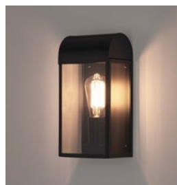
CODE: 1339001 FINISH: TEXTURED BLACK