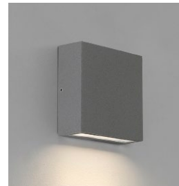
CODE: 1331010 (8199) FINISH: TEXTURED GREY

THIS PRODUCT IS SUITABLE FOR ONEROUS ENVIRONMENTS AND CAN BE INSTALLED WITHIN FIVE MILES OF THE COAST – THREE YEAR WARRANTY APPLIES.