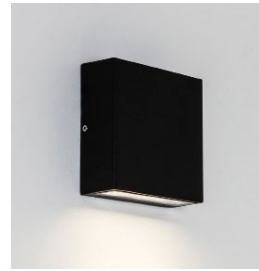
CODE: 1331001 (7201) FINISH: TEXTURED BLACK