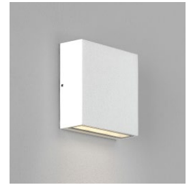
CODE: 1331008 (8116) FINISH: TEXTURED WHITE