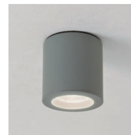
CODE: 1326012 (8198) FINISH: TEXTURED GREY

THIS PRODUCT IS NOT SUITABLE FOR INSTALLATION WITHIN FIVE MILES OF THE COAST. FOR THESE ENVIRONMENTS, PLEASE FILTER PRODUCTS ON THE ASTRO WEBSITE BY 'COASTAL'.