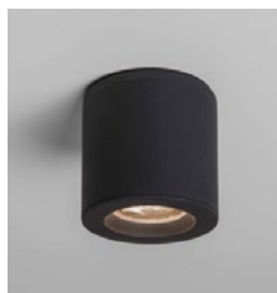
CODE: 1326004 (7495) FINISH: TEXTURED BLACK