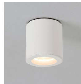
CODE: 1326002 (7176) FINISH: MATT WHITE