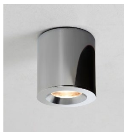
CODE: 1326001 (7175) FINISH: POLISHED CHROME