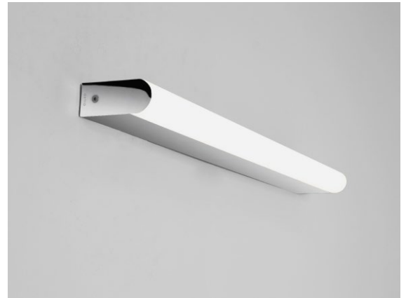
CODE: 7975 SKU: 1308007 FINISH: POLISHED CHROME