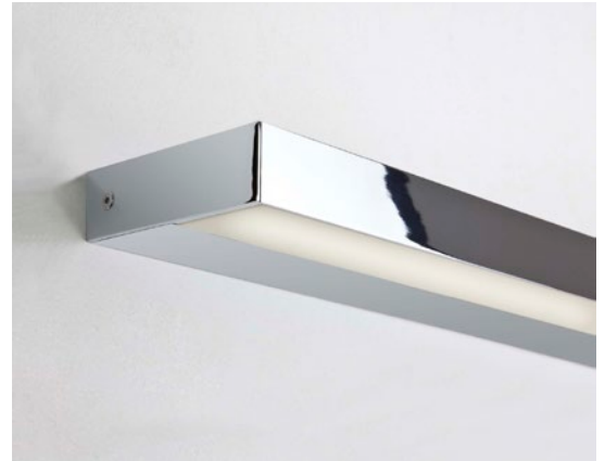
CODE: 1307009 (8180) FINISH: POLISHED CHROME

TO MAINTAIN THIS PRODUCT TO ITS BEST CONDITION, PLEASE VIEW OUR CARE AND CLEANING GUIDE ON THE SUPPORT SECTION OF THE ASTRO WEBSITE.