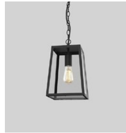
CODE: 1306013 FINISH: TEXTURED BLACK