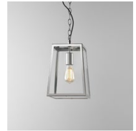
CODE: 1306014 FINISH: POLISHED NICKEL

THIS PRODUCT IS NOT SUITABLE FOR INSTALLATION WITHIN FIVE MILES OF THE COAST. FOR THESE ENVIRONMENTS, PLEASE FILTER PRODUCTS ON THE ASTRO WEBSITE BY 'COASTAL'.