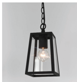
CODE: 1306003 FINISH: TEXTURED BLACK