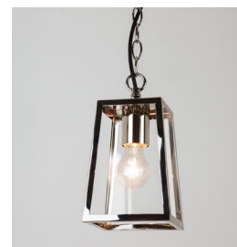
CODE: 1306004 FINISH: POLISHED NICKEL