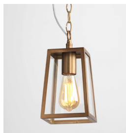
CODE: 1306006 FINISH: ANTIQUE BRASS

THIS PRODUCT IS NOT SUITABLE FOR INSTALLATION WITHIN FIVE MILES OF THE COAST. FOR THESE ENVIRONMENTS, PLEASE FILTER PRODUCTS ON THE ASTRO WEBSITE BY 'COASTAL'.