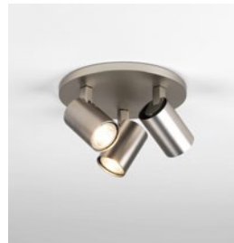
CODE: 1286012 FINISH: MATT NICKEL