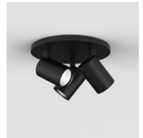
CODE: 1286082 FINISH: MATT BLACK

TO MAINTAIN THIS PRODUCT TO ITS BEST CONDITION, PLEASE VIEW OUR CARE AND CLEANING GUIDE ON THE SUPPORT SECTION OF THE ASTRO WEBSITE.