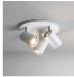
CODE: 1286002 FINISH: TEXTURED WHITE