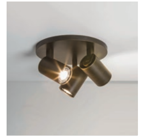
CODE: 1286005 FINISH: BRONZE