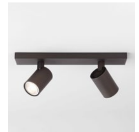
CODE: 1286035 FINISH: BRONZE