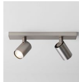
CODE: 1286036 FINISH: MATT NICKEL