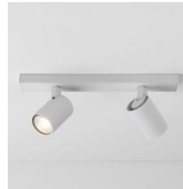
CODE: 1286034 FINISH: TEXTURED WHITE