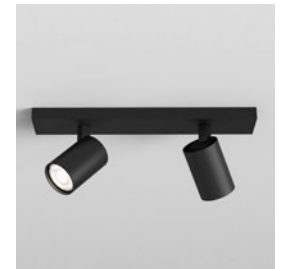
CODE: 1286081 FINISH: MATT BLACK

TO MAINTAIN THIS PRODUCT TO ITS BEST CONDITION, PLEASE VIEW OUR CARE AND CLEANING GUIDE ON THE SUPPORT SECTION OF THE ASTRO WEBSITE.