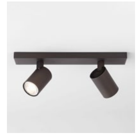
CODE: 1286035 FINISH: BRONZE