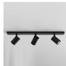
CODE: 1286083 FINISH: MATT BLACK

TO MAINTAIN THIS PRODUCT TO ITS BEST CONDITION, PLEASE VIEW OUR CARE AND CLEANING GUIDE ON THE SUPPORT SECTION OF THE ASTRO WEBSITE.