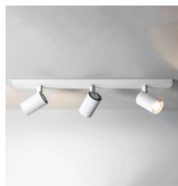
CODE: 1286003 FINISH: TEXTURED WHITE