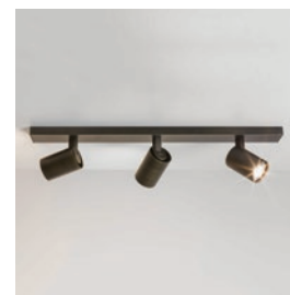
CODE: 1286006 FINISH: BRONZE