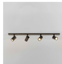
CODE: 1286008 FINISH: BRONZE