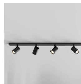
CODE: 1286084 FINISH: MATT BLACK

TO MAINTAIN THIS PRODUCT TO ITS BEST CONDITION, PLEASE VIEW OUR CARE AND CLEANING GUIDE ON THE SUPPORT SECTION OF THE ASTRO WEBSITE.