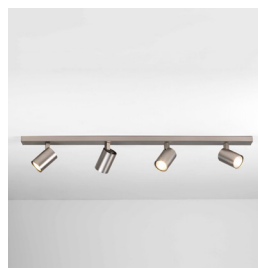
CODE: 1286014 FINISH: MATT NICKEL