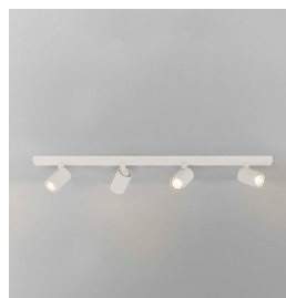
CODE: 1286007 FINISH: TEXTURED WHITE