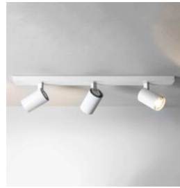
CODE: 1286003 FINISH: TEXTURED WHITE