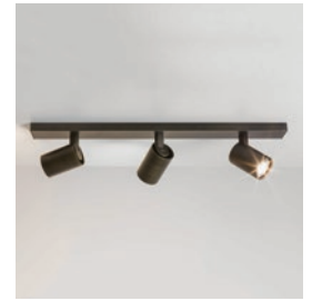
CODE: 1286006 FINISH: BRONZE