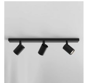
CODE: 1286083 FINISH: MATT BLACK

TO MAINTAIN THIS PRODUCT TO ITS BEST CONDITION, PLEASE VIEW OUR CARE AND CLEANING GUIDE ON THE SUPPORT SECTION OF THE ASTRO WEBSITE.