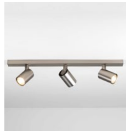
CODE: 1286013 FINISH: MATT NICKEL