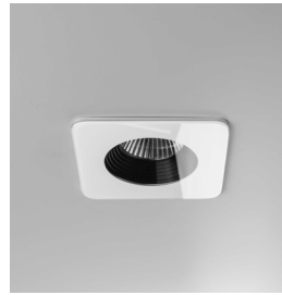
CODE: 1254014 FINISH: WHITE