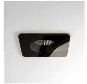
CODE: 1254017 FINISH: BLACK

TO MAINTAIN THIS PRODUCT TO ITS BEST CONDITION, PLEASE VIEW OUR CARE AND CLEANING GUIDE ON THE SUPPORT SECTION OF THE ASTRO WEBSITE.