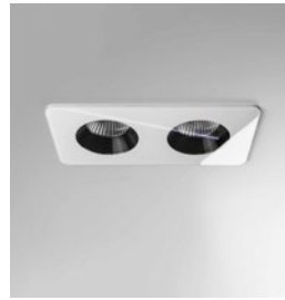
CODE: 1254015 FINISH: WHITE