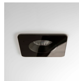
CODE: 1254017 FINISH: BLACK

TO MAINTAIN THIS PRODUCT TO ITS BEST CONDITION, PLEASE VIEW OUR CARE AND CLEANING GUIDE ON THE SUPPORT SECTION OF THE ASTRO WEBSITE.