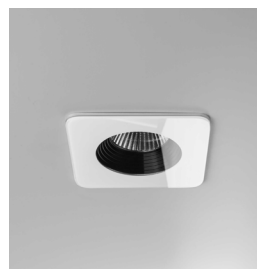
CODE: 1254014 FINISH: WHITE