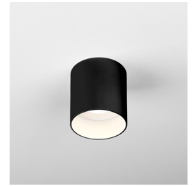
CODE: 1252023 FINISH: MATT BLACK

TO MAINTAIN THIS PRODUCT TO ITS BEST CONDITION, PLEASE VIEW OUR CARE AND CLEANING GUIDE ON THE SUPPORT SECTION OF THE ASTRO WEBSITE.