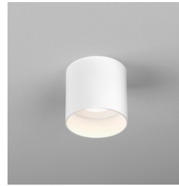
CODE: 1252022 FINISH: MATT WHITE