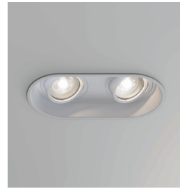
CODE: 1249028 FINISH: MATT WHITE