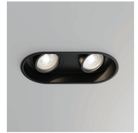
CODE: 1249029 FINISH: MATT BLACK

TO MAINTAIN THIS PRODUCT TO ITS BEST CONDITION, PLEASE VIEW OUR CARE AND CLEANING GUIDE ON THE SUPPORT SECTION OF THE ASTRO WEBSITE.