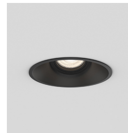
CODE: 1249026 (8535) FINISH: MATT BLACK

TO MAINTAIN THIS PRODUCT TO ITS BEST CONDITION, PLEASE VIEW OUR CARE AND CLEANING GUIDE ON THE SUPPORT SECTION OF THE ASTRO WEBSITE.