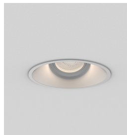
CODE: 1249025 (8534) FINISH: MATT WHITE