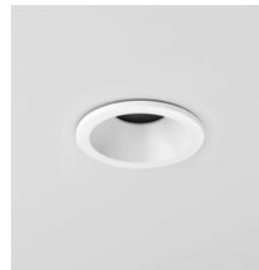
CODE: 1249012 FINISH: MATT WHITE