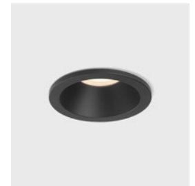
CODE: 1249017 FINISH: MATT BLACK

TO MAINTAIN THIS PRODUCT TO ITS BEST CONDITION, PLEASE VIEW OUR CARE AND CLEANING GUIDE ON THE SUPPORT SECTION OF THE ASTRO WEBSITE.