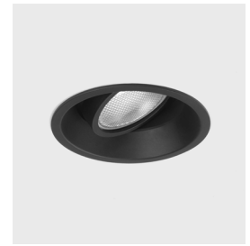
CODE: 1249016 FINISH: MATT BLACK

TO MAINTAIN THIS PRODUCT TO ITS BEST CONDITION, PLEASE VIEW OUR CARE AND CLEANING GUIDE ON THE SUPPORT SECTION OF THE ASTRO WEBSITE.