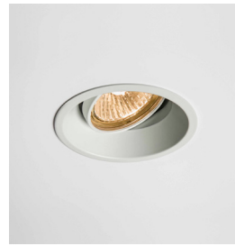
CODE: 1249003 FINISH: MATT WHITE