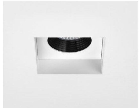
CODE: 1248012 FINISH: MATT WHITE

TO MAINTAIN THIS PRODUCT TO ITS BEST CONDITION, PLEASE VIEW OUR CARE AND CLEANING GUIDE ON THE SUPPORT SECTION OF THE ASTRO WEBSITE.