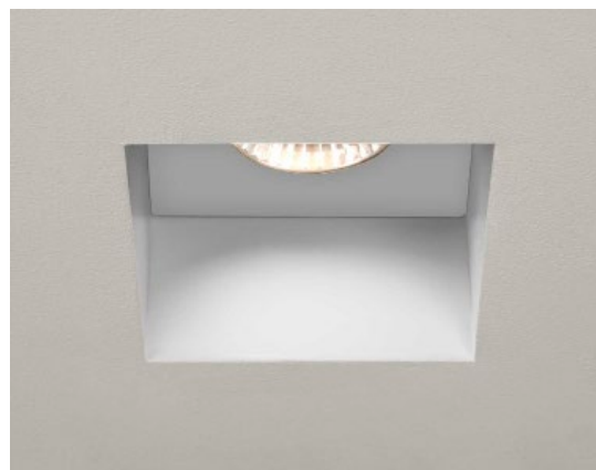
CODE: 1248005 (5670) FINISH: MATT WHITE

TO MAINTAIN THIS PRODUCT TO ITS BEST CONDITION, PLEASE VIEW OUR CARE AND CLEANING GUIDE ON THE SUPPORT SECTION OF THE ASTRO WEBSITE.