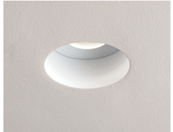
CODE: 1248002 FINISH: MATT WHITE

TO MAINTAIN THIS PRODUCT TO ITS BEST CONDITION, PLEASE VIEW OUR CARE AND CLEANING GUIDE ON THE SUPPORT SECTION OF THE ASTRO WEBSITE.