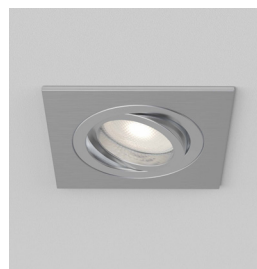
CODE: 1240029 FINISH: BRUSHED ALUMINIUM