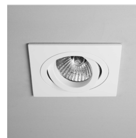
CODE: 1240030 FINISH: MATT WHITE

TO MAINTAIN THIS PRODUCT TO ITS BEST CONDITION, PLEASE VIEW OUR CARE AND CLEANING GUIDE ON THE SUPPORT SECTION OF THE ASTRO WEBSITE.