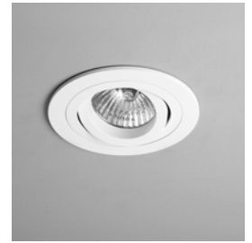
CODE: 1240028 FINISH: MATT WHITE

TO MAINTAIN THIS PRODUCT TO ITS BEST CONDITION, PLEASE VIEW OUR CARE AND CLEANING GUIDE ON THE SUPPORT SECTION OF THE ASTRO WEBSITE.