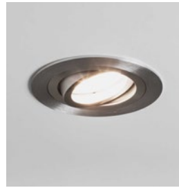
CODE: 1240027 FINISH: BRUSHED ALUMINIUM