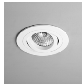
CODE: 1240028 FINISH: MATT WHITE

TO MAINTAIN THIS PRODUCT TO ITS BEST CONDITION, PLEASE VIEW OUR CARE AND CLEANING GUIDE ON THE SUPPORT SECTION OF THE ASTRO WEBSITE.