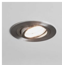
CODE: 1240027 FINISH: BRUSHED ALUMINIUM