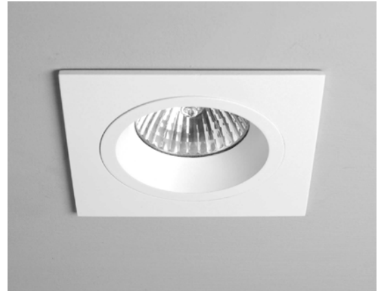
CODE: 1240026 FINISH: MATT WHITE

TO MAINTAIN THIS PRODUCT TO ITS BEST CONDITION, PLEASE VIEW OUR CARE AND CLEANING GUIDE ON THE SUPPORT SECTION OF THE ASTRO WEBSITE.