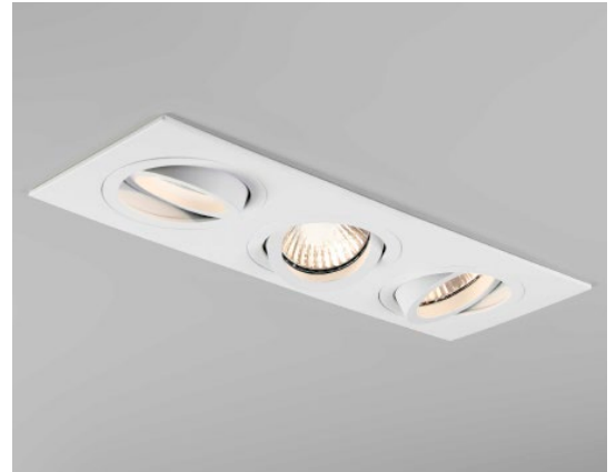
CODE: 1240019 (5650) FINISH: MATT WHITE

TO MAINTAIN THIS PRODUCT TO ITS BEST CONDITION, PLEASE VIEW OUR CARE AND CLEANING GUIDE ON THE SUPPORT SECTION OF THE ASTRO WEBSITE.