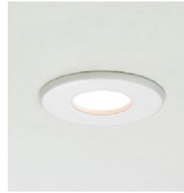
CODE: 1236011 (5621) FINISH: MATT WHITE