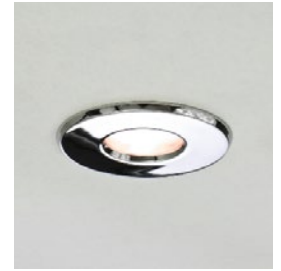
CODE: 1236012 (5622) FINISH: POLISHED CHROME

TO MAINTAIN THIS PRODUCT TO ITS BEST CONDITION, PLEASE VIEW OUR CARE AND CLEANING GUIDE ON THE SUPPORT SECTION OF THE ASTRO WEBSITE.