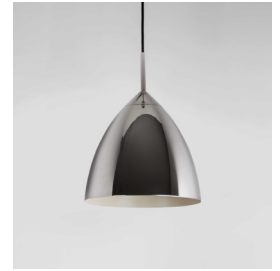
CODE: 1223024 FINISH: POLISHED CHROME