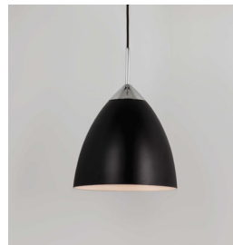
CODE: 1223023 FINISH: MATT BLACK