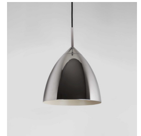
CODE: 1223024 FINISH: POLISHED CHROME