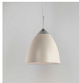
CODE: 1223025 FINISH: CREAM

TO MAINTAIN THIS PRODUCT TO ITS BEST CONDITION, PLEASE VIEW OUR CARE AND CLEANING GUIDE ON THE SUPPORT SECTION OF THE ASTRO WEBSITE.