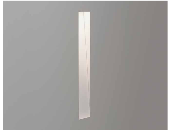
CODE: 1212040 FINISH: MATT WHITE

TO MAINTAIN THIS PRODUCT TO ITS BEST CONDITION, PLEASE VIEW OUR CARE AND CLEANING GUIDE ON THE SUPPORT SECTION OF THE ASTRO WEBSITE.