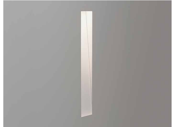
CODE: 7567 SKU: 1212038 FINISH: MATT WHITE