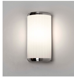
CODE: 1194017 FINISH: POLISHED CHROME