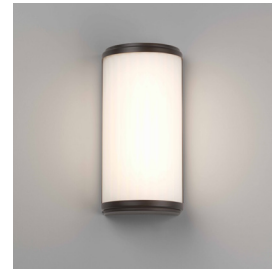
CODE: 1194019 FINISH: BRONZE

TO MAINTAIN THIS PRODUCT TO ITS BEST CONDITION, PLEASE VIEW OUR CARE AND CLEANING GUIDE ON THE SUPPORT SECTION OF THE ASTRO WEBSITE.