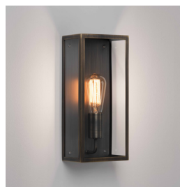
CODE: 1183020 FINISH: BRONZE

TO MAINTAIN THIS PRODUCT TO ITS BEST CONDITION, PLEASE VIEW OUR CARE AND CLEANING GUIDE ON THE SUPPORT SECTION OF THE ASTRO WEBSITE.