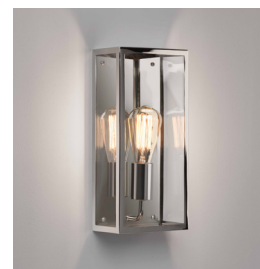
CODE: 1183008 FINISH: POLISHED NICKEL