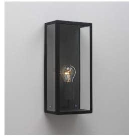
CODE: 1183001 FINISH: TEXTURED BLACK