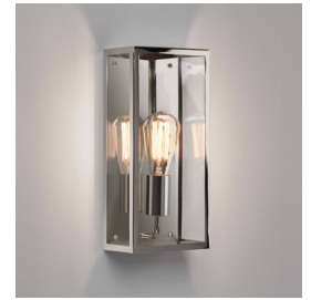
CODE: 1183008 FINISH: POLISHED NICKEL