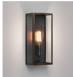
CODE: 1183011 FINISH: BRONZE

TO MAINTAIN THIS PRODUCT TO ITS BEST CONDITION, PLEASE VIEW OUR CARE AND CLEANING GUIDE ON THE SUPPORT SECTION OF THE ASTRO WEBSITE.