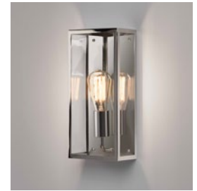
CODE: 1183006 FINISH: POLISHED NICKEL