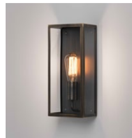
CODE: 1183018 FINISH: BRONZE

THIS PRODUCT IS NOT SUITABLE FOR INSTALLATION WITHIN FIVE MILES OF THE COAST. FOR THESE ENVIRONMENTS, PLEASE FILTER PRODUCTS ON THE ASTRO WEBSITE BY 'COASTAL'.