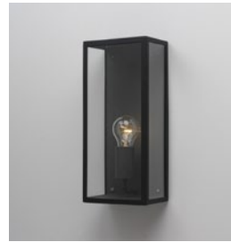
CODE: 1183005 FINISH: TEXTURED BLACK