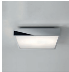
CODE: 1169018 FINISH: POLISHED CHROME