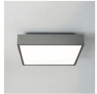
CODE: 1169019 FINISH: MATT NICKEL

TO MAINTAIN THIS PRODUCT TO ITS BEST CONDITION, PLEASE VIEW OUR CARE AND CLEANING GUIDE ON THE SUPPORT SECTION OF THE ASTRO WEBSITE.