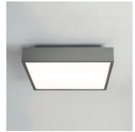
CODE: 1169015 (8530) FINISH: MATT NICKEL

TO MAINTAIN THIS PRODUCT TO ITS BEST CONDITION, PLEASE VIEW OUR CARE AND CLEANING GUIDE ON THE SUPPORT SECTION OF THE ASTRO WEBSITE.