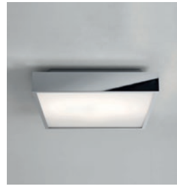
CODE: 1169014 (8529) FINISH: POLISHED CHROME