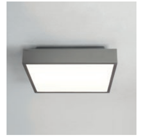
CODE: 1169015 (8530) FINISH: MATT NICKEL

TO MAINTAIN THIS PRODUCT TO ITS BEST CONDITION, PLEASE VIEW OUR CARE AND CLEANING GUIDE ON THE SUPPORT SECTION OF THE ASTRO WEBSITE.