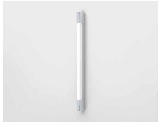
CODE: 1150009 FINISH: POLISHED CHROME

TO MAINTAIN THIS PRODUCT TO ITS BEST CONDITION, PLEASE VIEW OUR CARE AND CLEANING GUIDE ON THE SUPPORT SECTION OF THE ASTRO WEBSITE.