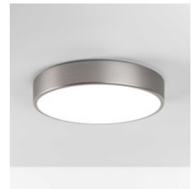
CODE: 1125005 FINISH: MATT NICKEL