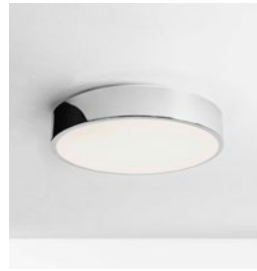
CODE: 1125004 FINISH: POLISHED CHROME