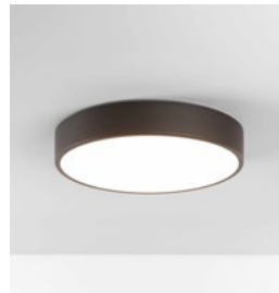
CODE: 1125006 FINISH: BRONZE

TO MAINTAIN THIS PRODUCT TO ITS BEST CONDITION, PLEASE VIEW OUR CARE AND CLEANING GUIDE ON THE SUPPORT SECTION OF THE ASTRO WEBSITE.