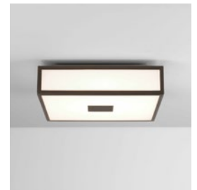
CODE: 1121044 FINISH: BRONZE