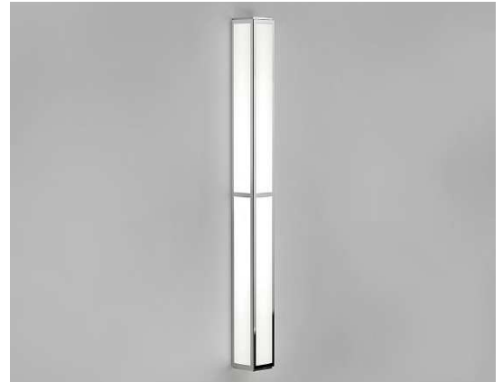
CODE: 1121066 (8419) FINISH: POLISHED CHROME

TO MAINTAIN THIS PRODUCT TO ITS BEST CONDITION, PLEASE VIEW OUR CARE AND CLEANING GUIDE ON THE SUPPORT SECTION OF THE ASTRO WEBSITE.