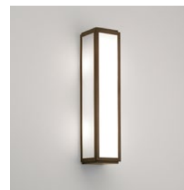
CODE: 1121060 FINISH: BRONZE