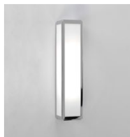
CODE: 1121018 FINISH: POLISHED CHROME