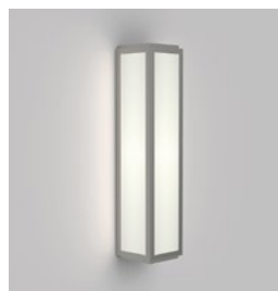
CODE: 1121065 FINISH: MATT NICKEL

TO MAINTAIN THIS PRODUCT TO ITS BEST CONDITION, PLEASE VIEW OUR CARE AND CLEANING GUIDE ON THE SUPPORT SECTION OF THE ASTRO WEBSITE.