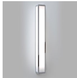
CODE: 1121020 (7134) FINISH: POLISHED CHROME