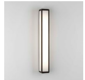
CODE: 1121058 (8291) FINISH: BRONZE

THIS PRODUCT IS SUITABLE FOR ONEROUS ENVIRONMENTS AND CAN BE INSTALLED WITHIN FIVE MILES OF THE COAST - THREE YEAR WARRANTY APPLIES.